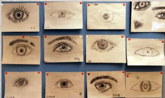
Task: drawing your own eye on charcoal technique using a mirror.

As you may already know, during this term Grade 6 & 7 have been working on their unit: “Landscape painting”. After getting inspirations from famous landscape paintings, gathering some visual resources for their individual landscape projects and successfully experimenting with a wide variety of watercolour techniques (wet on wet, wet on dry, blot, glazing, wash, splashing, stencilling, blowing, etc); our students have sketched their best composition in their Arts journal and have just started their final watercolour landscape project. They are all very busy and engaged trying to implement correctly those techniques experimented and a good variety of elements of Art. It is really exciting to see how their work is developing. Soon they will be able to share with ISCS community their final results in an exhibition.