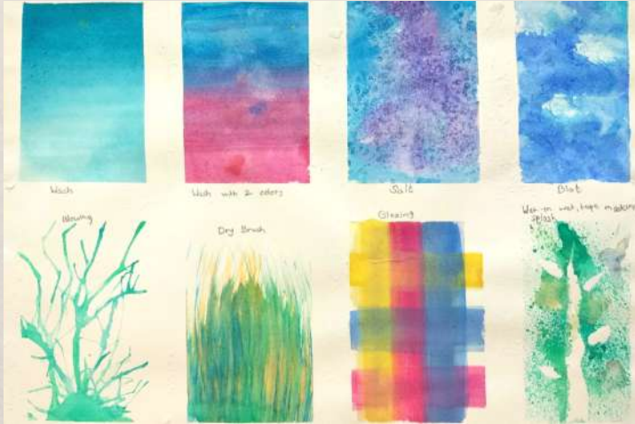
Watercolour experimentation task by Meri (Grade7)