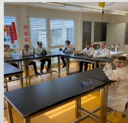
KS2 students in the Science Lab