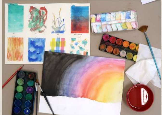
Work in progress by Bethany Boston (Grade 6)