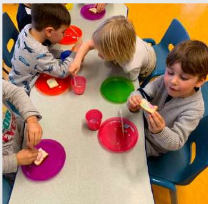
EY making colourful bread!

The Early Years students are well past counting to 10! We created kites and counted beads to decorate the kites. Some students were able to count all the way to 100! In literacy, we have been focusing on phase 1 phonics which are the letters S,A,T,P,I,N. Knowing these letters and sounds will help them with sounding out 3 letter words. Lastly, a fun scientific activity that we did last week was rainbow bread! We mixed food colouring with milk and then used droppers to decorate white bread with the colours. Of course we also ate the colourful bread too!