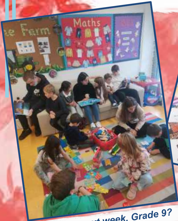
Same time next week, Grade 9?