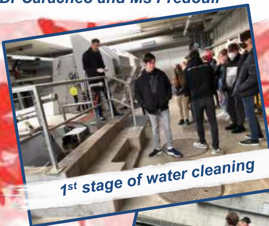
1st stage of water cleaning