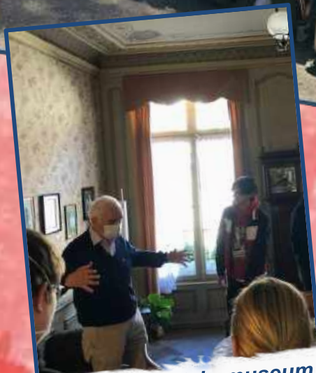
Inside the Einstein museum... Thank you for your explanations, Professor!