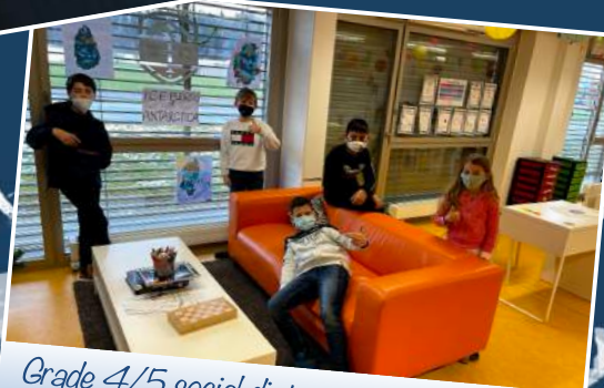
Grade 4/5 social distancing and wearing their funky masks!