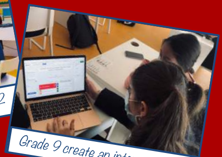
Grade 9 create an interactive quiz

RESPECT • EXCELLENCE • INTERNATIONAL MINDEDNESS •