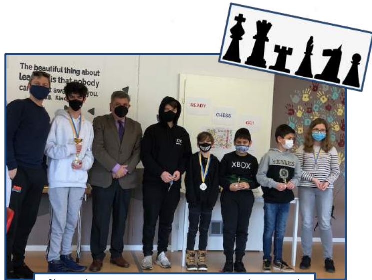
Chess champions: our winners receiving their awards

The winners have received a trophy or medal, as well as house points for their respective teams. Fantastic!