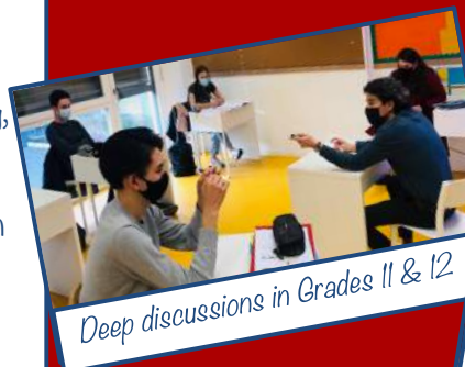
Deep discussions in Grades 11 & 12

Students took part in a range of activities this morning, exploring, in particular, events and issues of the past year. They learned more about the Black Lives Matter movement, with the help of TED resources, including an interview with the BLM founders. They also designed interactive quizzes to test each other on facts they learned on the 'Black History' topic.