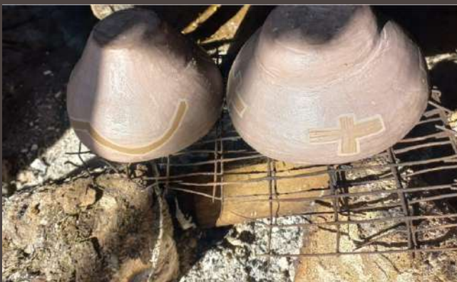
Handmade Bowls from the Achuar

In total, we have raised 2400CHF, which will be used to purchase school materials for each of the Achuar students and also a printer for their school! Overall, the project was quite a success and it was an amazing learning experience for all the students involved. Thank you to all the students, teachers, members of staff and parents who contributed to the project!